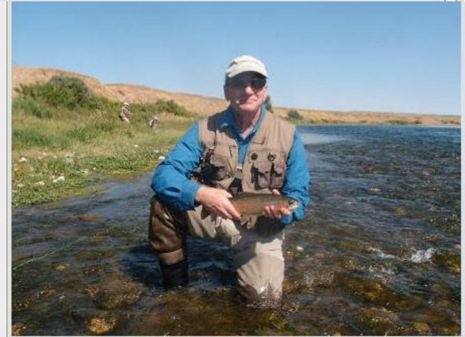
Slough Creek.jpg [ 60.00 KiB | Viewed 1878 times ]