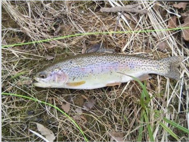
Rainbow.JPG [ 119.7 KiB | Viewed 4113 times ]