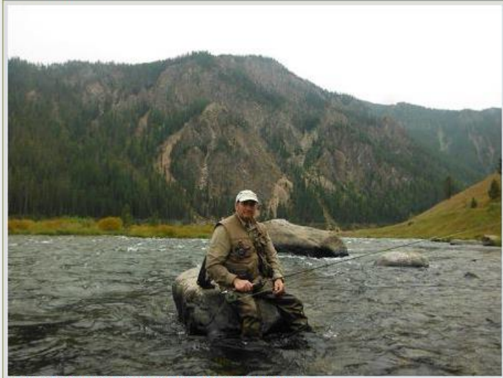
Madison River.jpg [ 26.59 KiB | Viewed 3078 times ]