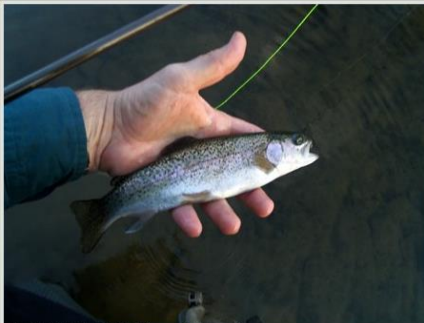
100_0147.JPG [ 57.33 KiB | Viewed 4277 times ]