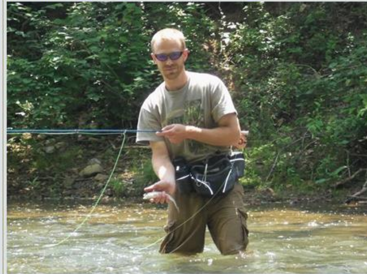
Scott, So. River Rainbow.jpg [ 93.11 KiB | Viewed 3665 times ]