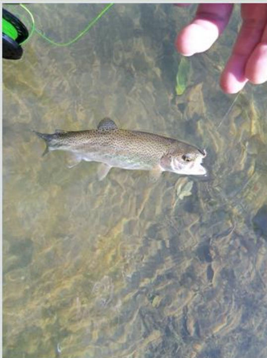
Rainbow Trout.jpg [ 73.01 KiB | Viewed 4331 times ]