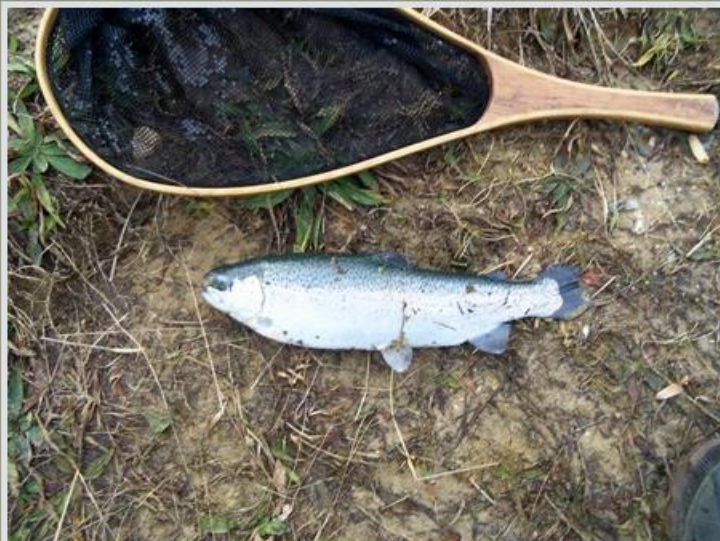
AP Hill.jpg [ 104.55 KIB | Viewed 2579 times ]