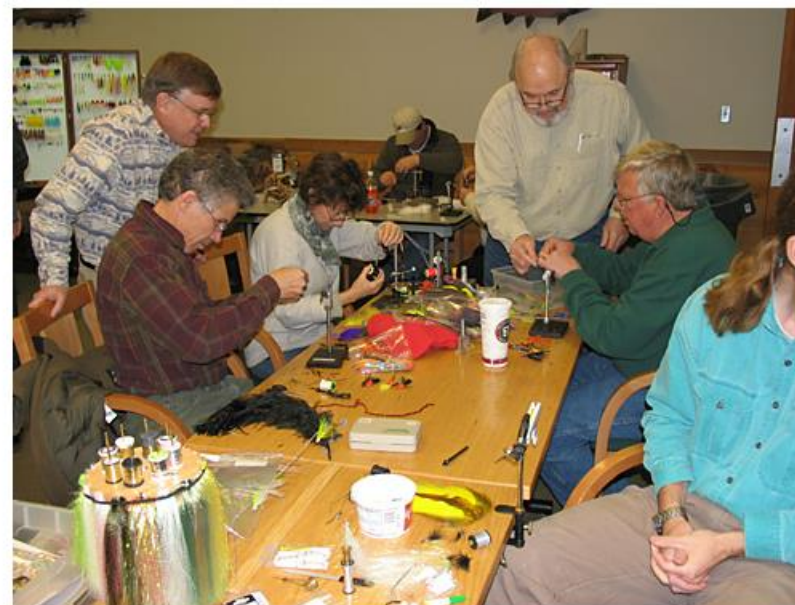
fly tying demonstrations

Click for Fredericksburg, Virginia Forecast