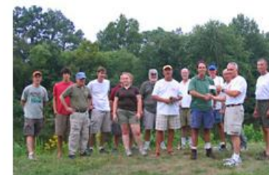
Financial Support For Conservation Groups (Friends of the Rappahannock)