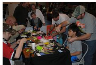
Fly Tying Clinics for all Ages