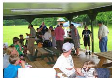
Annual Youth Fly Fishing Festival

Click for Fredericksburg, Virginia Forecast