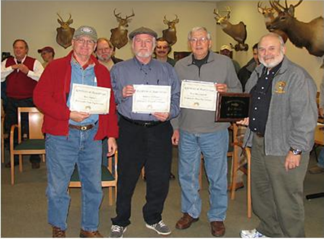
Charter Members - Here since the beginning!

Click for Fredericksburg, Virginia Forecast