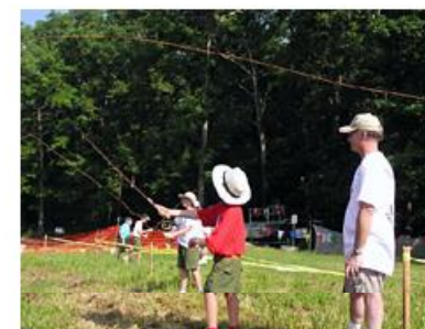
FFFF at the National Boy Scout Jamboree