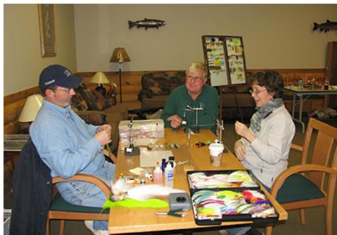
Tying up some flies

Click for Fredericksburg, Virginia Forecast